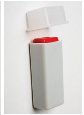
YELLOW FOR MICROPREEMIES TO FULL-TERM BABIES