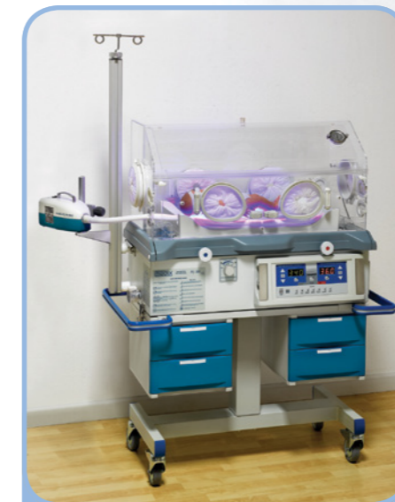
neoBLUE blanket in an incubator