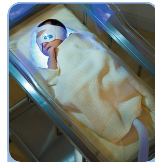
The baby may be swaddled or covered with a blanket for warmth during phototherapy