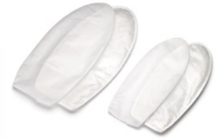
Mattress & Disposable Covers