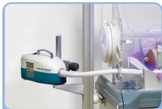
neoBLUE blanket available with optional hardware for pole-mounting applications