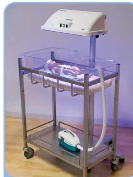
neoBLUE blanket in a bassinet