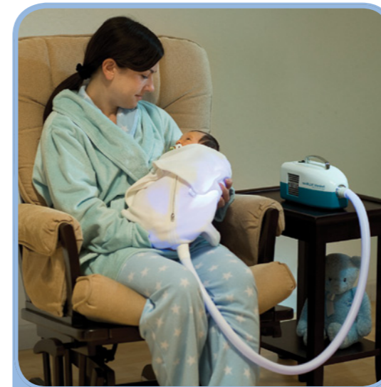
Allows infant-parent bonding in the hospital or at home