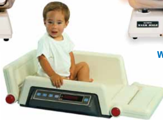
Pediatric Smart Scale® Model 50