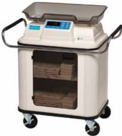
Smart Scale® Model 65