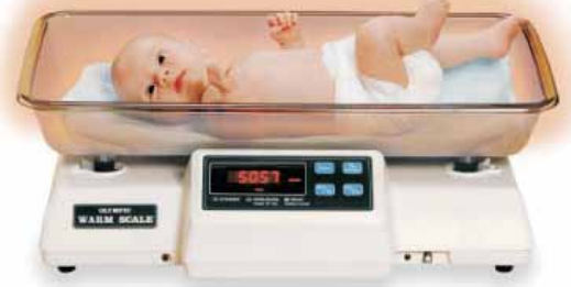
Warm Scale™ Model 23