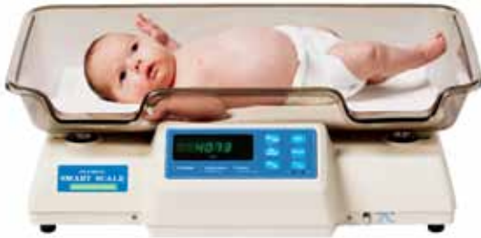
Smart Scale® Model 60

Precision scales that weigh patients from infants to toddlers — quickly, accurately & safely. All are available in roll-around or table-top configurations and come complete with rechargeable batteries.