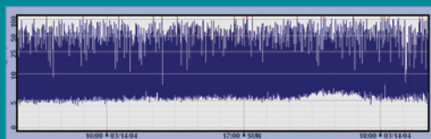
Trace appears normal without CFMsight