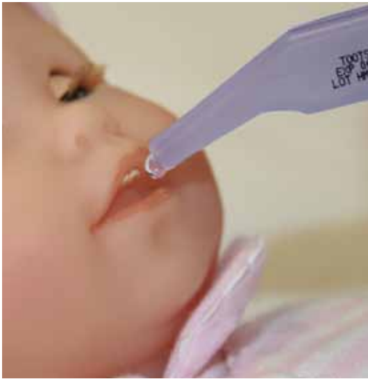
TWIST-TIP VIALS – CONVENIENT FOR SINGLE DOSES – LESS WASTE – PURPLE VIALS TO INDICATE ORAL USE