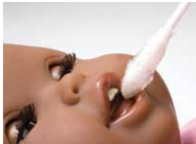
BABIES ENJOY IT

Give your babies the comfort of oral care with the gentle foam tip swab applicator