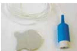
ESSENTIALS – OHMEDA STYLE