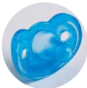
FULL-TERM SIZE BLUE