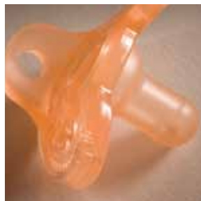
Carter ~ born at 28 weeks