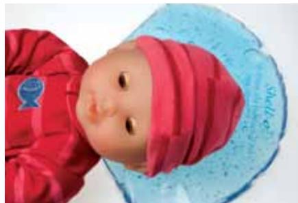
FOLD TAIL UNDER TO THICKEN PILLOW FOR LARGER BABIES

Helps reduce pressure to tender preemie heads – Shell-O can help minimize head molding and skin breakdown in preemies and immobilized patients