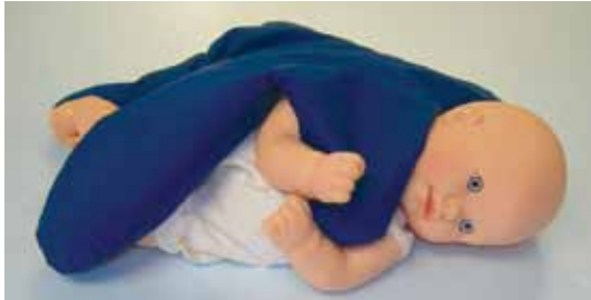
STAR SHAPE PROVIDES MANY POSITIONING OPTIONS

Meets a wide variety of positioning needs for your babies – use to assist a facilitative tuck, to position head and neck, hips, extremities or as an extra set of hands • Asymmetrical arms and legs – place and adjust individually • Approximate weight: 1lb