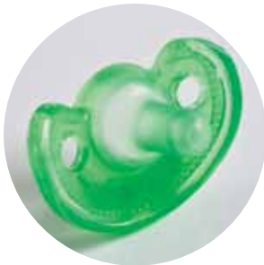
PREEMIE SIZE GREEN

LIGHTER WEIGHT THAN OTHER SILICONE PACIFIERS – GUMDROP STAYS IN BABIES' MOUTHS LONGER – NURSES AND PARENTS APPRECIATE THAT