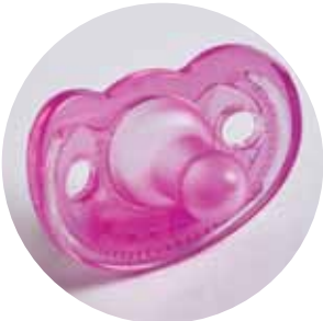
FULL-TERM SIZE PINK