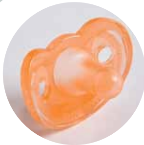
FULL-TERM SIZE ORANGE