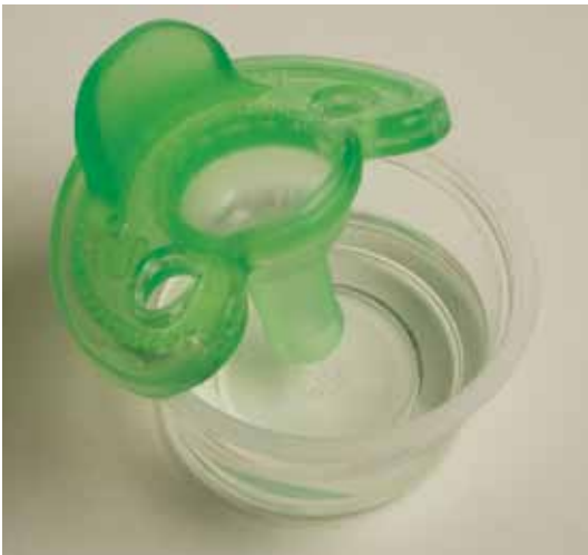
THE LARGE TOOTSWEET CUP ALLOWS EASY DIPPING OF OUR GUMDROP PACIFIER – ELIMINATES OVERFLOW

TootSweet is the first and only sucrose solution that we know of to meet these standards. That means with TootSweet you can be sure your newborns and fragile preemies are not exposed to potentially harmful sucrose borne bacteria. TootSweet's preservatives are found in Ora-Sweet™, Gentamicin, Caffeine Citrate, and other products commonly administered to preemies and full-term babies.